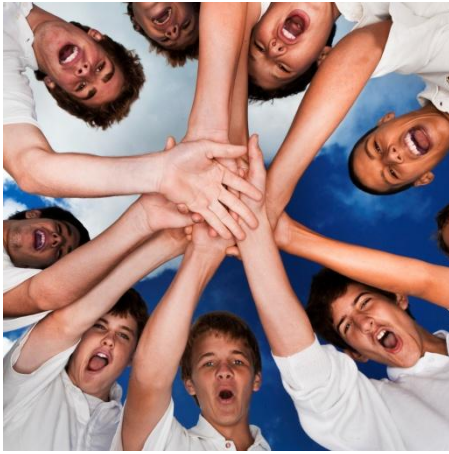
Companies benefit from great team-players