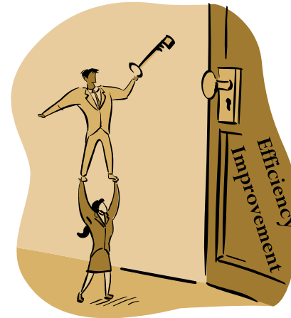
Great teamwork enables great efficiency